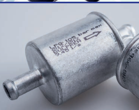
5 lines of text