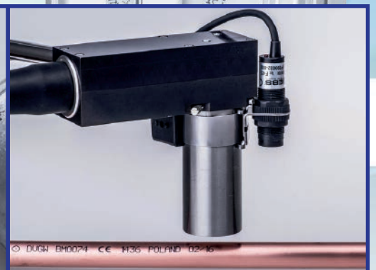
90 degree printhead option